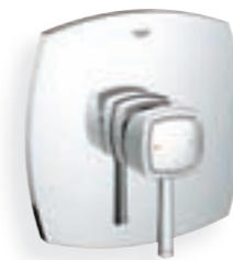
19 932 000 Shower mixer ● ● ●