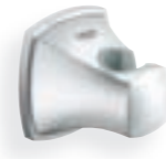
27 969 000 Hand shower holder