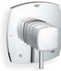
19 938 000 USA / Canada Grohflex shower/bath dual function Pressure balance valve trim ● ● ●