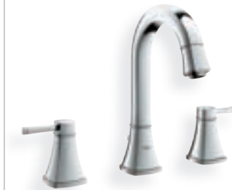
20 389 000 3-hole basin mixer high spout ● ● ● 20 419 000 USA / Canada ● ● ●