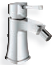
23 315 000 Bidet mixer ● ● ●