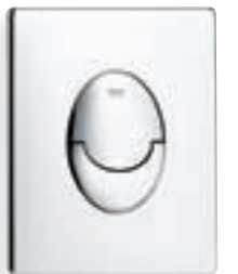
38 505 000 Skate Air Flush Actuation Plate