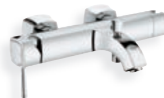
23 317 000 Bath/shower mixer ● ● ●