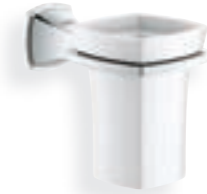
40 626 000 Holder + Tumbler