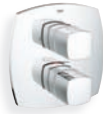
19 948 000 Thermostat-Wannenbatterie mit 2-Wege-Umstellung ● ● ● ● ●