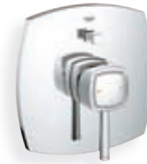
19 920 000 Bath/shower mixer ● ● ●