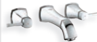
20 414 000 | 20 415 000 3-hole basin mixer projection 177 mm | 234 mm ● ● ● 20 416 000 USA / Canada projection 234 mm ● ● ●