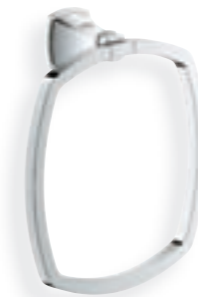
40 630 000 Towel ring