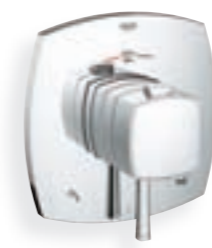
19 939 000 USA / Canada Grohflex shower/bath dual function Thermostatic trim ● ● ●