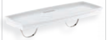
18 651 000 GROHE EasyReach™ storage