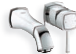
19 929 000 | 19 930 000 3-hole basin mixer projection 177 mm | 234 mm ● ● ● 19 931 000 USA / Canada projection 234 mm ● ● ●