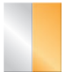
● Chrome / Gold – IGO

Bright and precise – the Grandera™ collection in the chrome finish casts your bathroom in a very special light. And for a very, very long time. GROHE SilkMove® technology ensures ultimate ease of use.