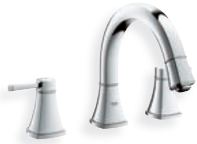
25 154 000 USA / Canada Roman Tub Filler ● ●