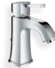
23 303 000 Basin mixer ● ● ● 23 311 000 USA / Canada ● ● ●