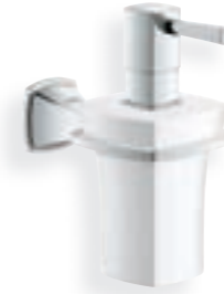
40 627 000 Shelf + Soap dispenser