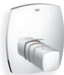
19 941 000 Central thermostat ● ● ●