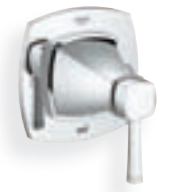
19 942 000 5-way diverter ● ● ● ● ●