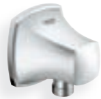
27 970 000 Shower outlet elbow