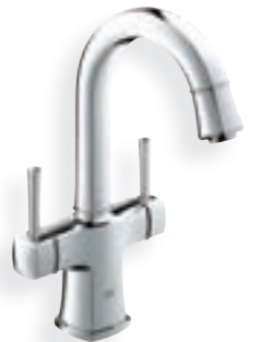
21 107 000 Basin mixer ● ● ● 21 108 000 USA / Canada ● ● ●