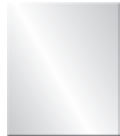
● Chrome – 000