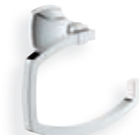
40 625 000 Toilet paper holder