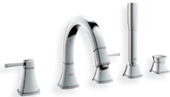
19 919 000 5-hole bath combination ● ● ● ● ●