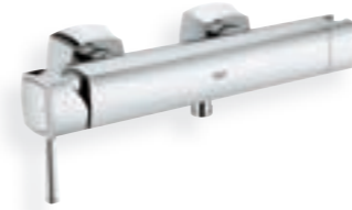
23 316 000 Shower mixer ● ● ●