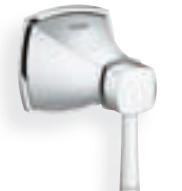
19 944 000 Concealed valve ● ● ● ● ●