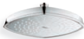
27 974 000 Head shower 210 mm 1 spray pattern: Rain 27 976 000 USA / Canada, 2.0 gpm