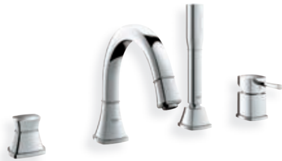
19 936 000 4-hole bath combination ● ● ● ●