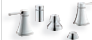
24 034 000 USA / Canada wideset bidet mixer ● ● ●