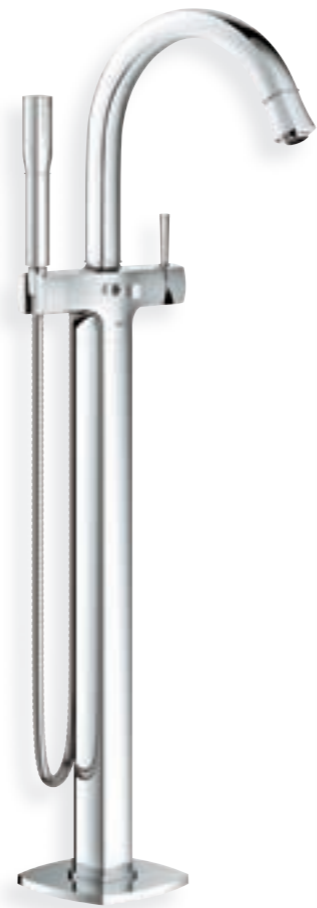
23 318 000 Bath/shower mixer floor mounted ● ● ● ●