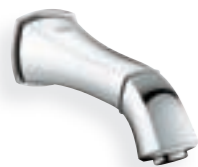
13 341 000 Bath spout ● ● ● 13 342 000 USA / Canada ● ● ●