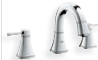
20 417 000 3-hole basin mixer ● ● ● 20 418 000 USA / Canada ● ● ●