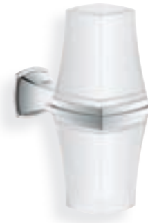
40 661 000 Lamp