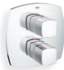
19 934 000 Thermostatic shower mixer ● ● ● ● ● 19 937 000 Thermostatic shower mixer with 2 way diverter ● ● ● ●