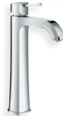
23 313 000 Basin mixer for free-standing basins ● ● ● 23 314 000 USA / Canada ● ● ●